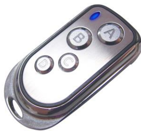
W-2 Wireless Transmitter

Wireless remote control system W-2 consists of a transmitter equipped with four buttons to activate, deactivate, increase and decrease fog output and an onboard receiver attached to the rear panel of FT-20 fog machine.