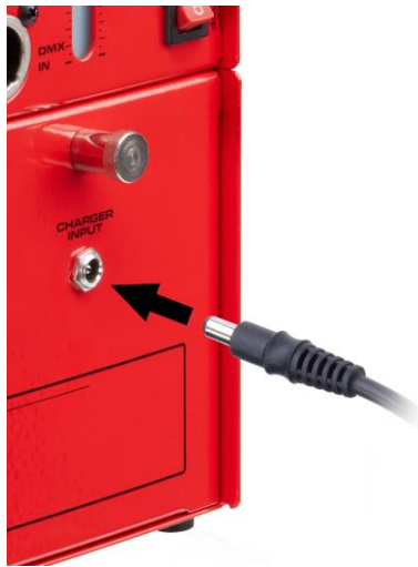
Plug in charger

Step 3: Charge the battery by plug the charger adaptor into a grounded electrical outlet. Yellow light on the adaptor indicates charging, when it turn green indicate charge complete. Please note the battery require 15 hours charge time.