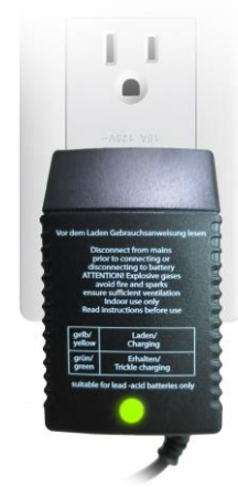
Green indicates charging complete