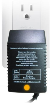
Yellow indicates charging